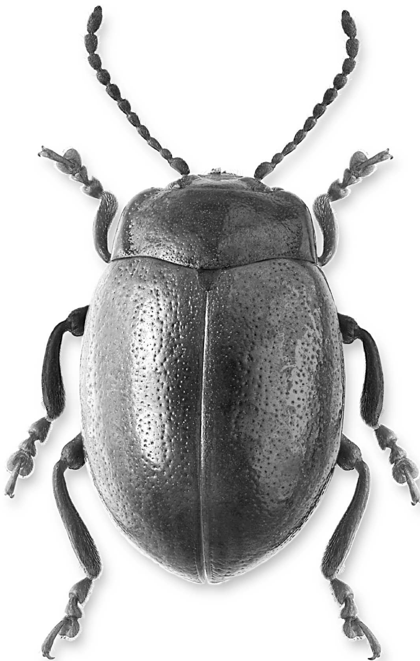
Fig. 1. Habitus photograph of Chrysolina staphylaea .